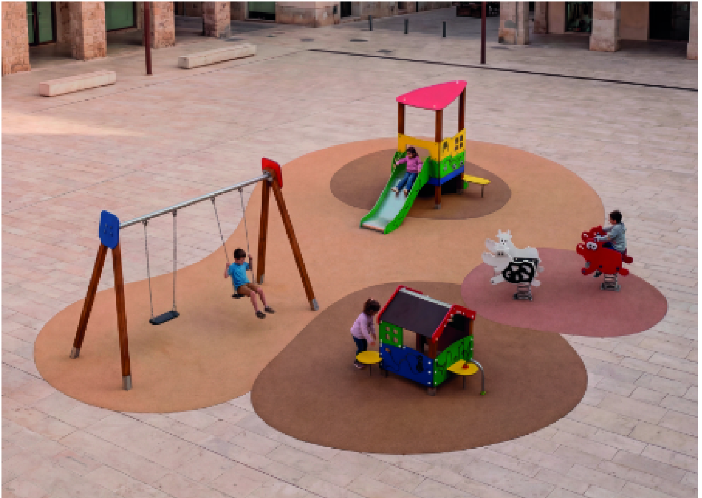
MADERA 1 Flat 1 Cradle JL1511000