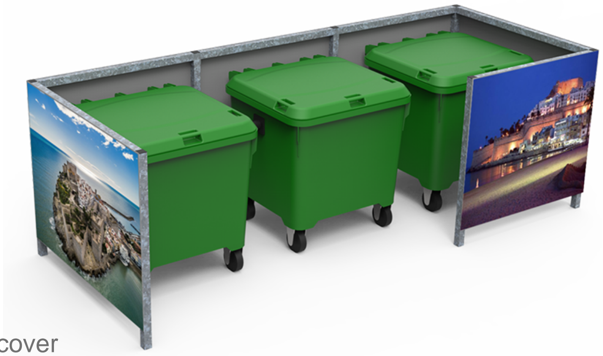
VCD2 Container cover