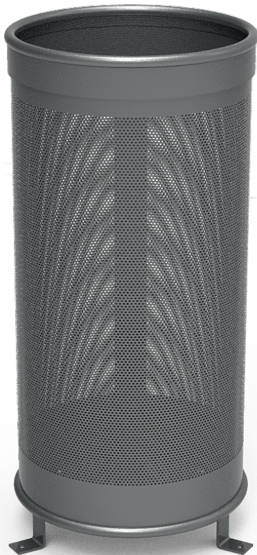
Fija Aro with Lid PA620T